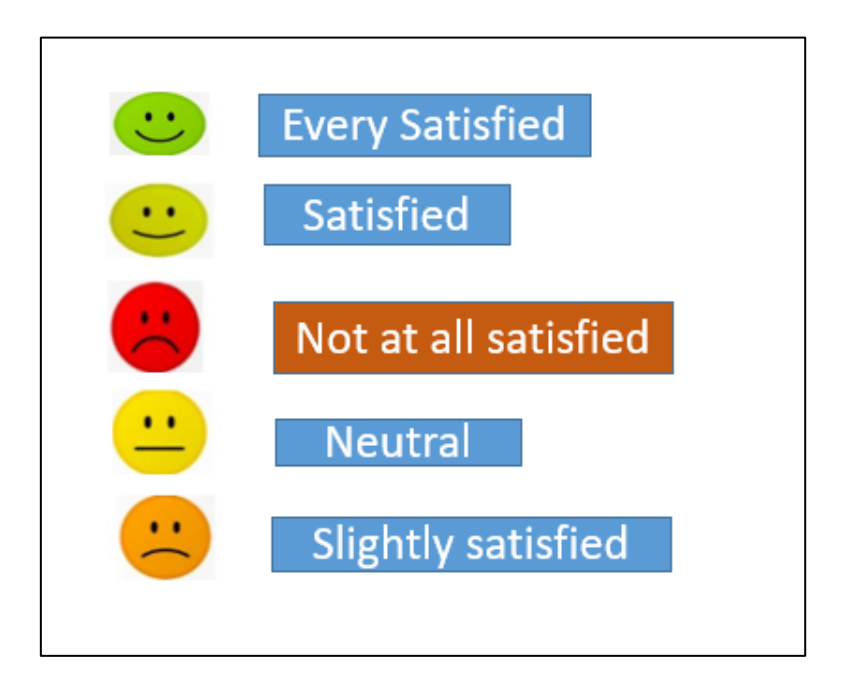
Figure 2: Likert Scale and its scoring interpretation

The descriptive and inferential statistics of both the sampled data, such as the age of SMEs and the production industry. After missing data were excluded, 200 questionnaires were taken into consideration for further study.