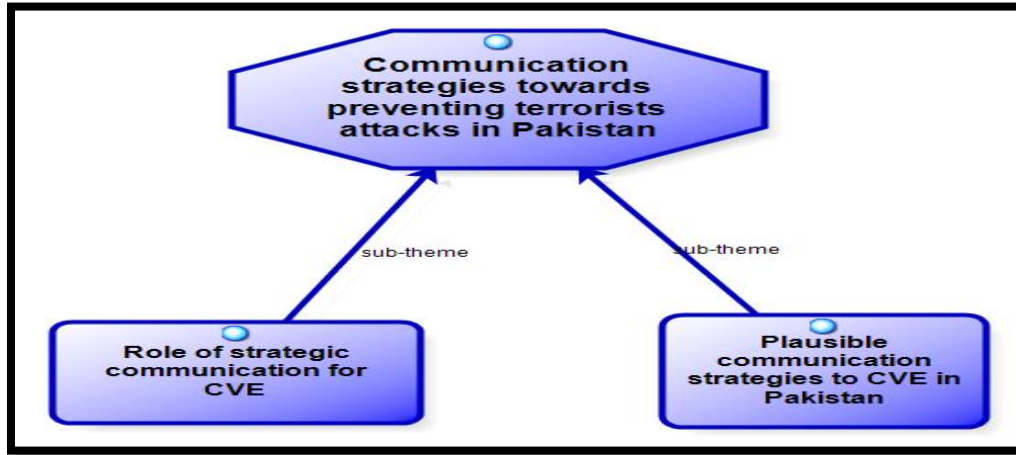
Figure 1. Communication strategies for countering violence extremism.

necessity for an evidenced-based understanding of how democracies can react to such threats. Therefore, in line with these perspectives, the analysis of interviews shown the emerged themes, as indicated in Figure 1, are communication strategies for countering violent extremism.