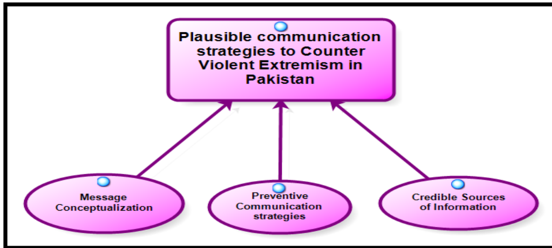
Figure 3. Plausible communication strategies to Counter Violent Extremism in Pakistan