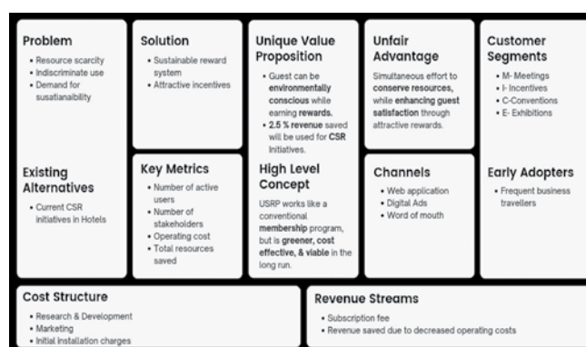
Figure 1: Conceptual framework

The Lean Canvas Model: This matrix takes into account all key areas that need intense brainstorming before a project can be implemented. These include the target customer segments, the problem, its solution, the cost structure, its revenue streams, the business channels, the unique value proposition, an unfair advantage, along with the key statistics that monitor the growth of the project.