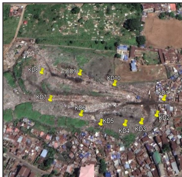
Fig. (1): Kingtom Dumpsite.

At each of the two dumpsites selected, measurements were made randomly at ten (10) different points at about 5 m apart and the survey meter was held at the gonald level (about 1 meter above ground level) for effective detection. During measurement the meter was switched on to absorb radiation for few seconds and stable reading recorded. The procedure was repeated at each location and readings were recorded in micro Sievert per hour \mu Sv/hr . The mean values were obtained from the data collected.