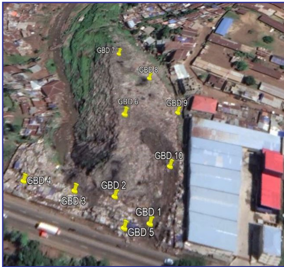
Fig. (2): Granville Brooke Dumpsite.