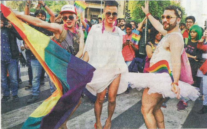
While in September 2018 the Supreme Court of India decriminalised homosexuality, same-sex marriages are not legally recognised in the country