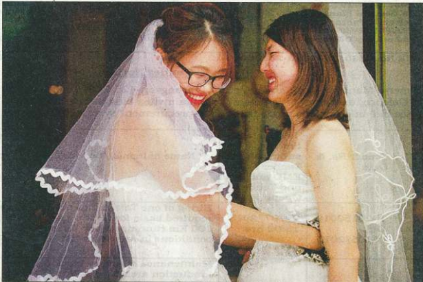
CAMPAINING COUPLE: A Chinese lesbian couple held a simple ceremony in Beijing on Thursday to announce their informal marriage. In their push to get same-sex unions recognized in China, the couple said they were inspired by the US top court's decision to extend gay marriage across all 50 states