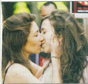
WITH LOVE, FROM HOLLANDE