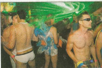
PARTY PANGS: A gay party in Cape Town