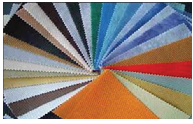
Figure 2: Spun-bond non-woven