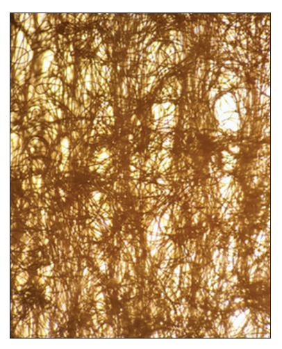
Figure 7: Polyester + Viscose Fab