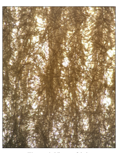
Figure 6: Viscose fabric