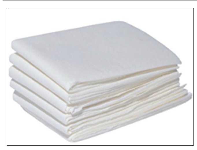
Figure 1: Spun-lace non-woven