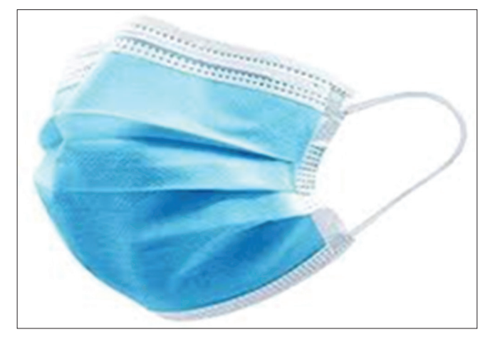
Figure 3: Melt-blown non-woven