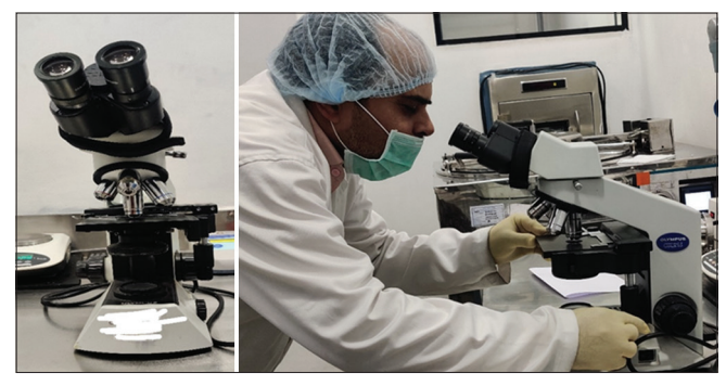
Figure 4: Visualizing fabric structure by Olympus CX21 microscope