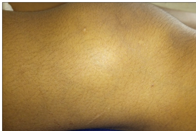
Figure 1: Before treatment