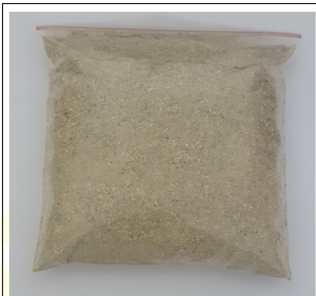
Fig. 1. Powder of whole plant of Bala