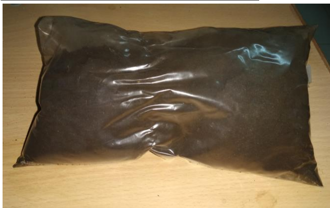
Drug in powder form (extract)