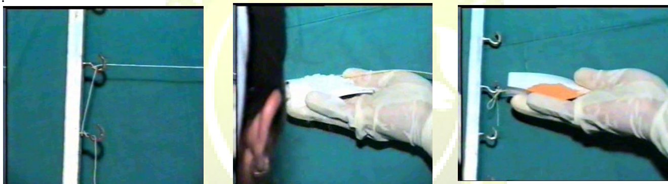
Figure 1: Preparation of Palasha Ksharasutra

The method of preparation of Palash Ksharasutra was same as standard Ksharasutra except the drug which has been replaced by Plasha Ksharasutra . The method includes 11 coatings of Snuhi Ksheera alone, 7 coating of Snuhi Ksheera and Kshara prepared by Palasha and finally 3 coating of Snuhi Ksheera and Haridra powder. Total 21 coatings were applied on every Ksharasutra . The prepared Ksharasutra were placed for sterilization in Ksharasutra chamber and stored in glass test tubes for later use