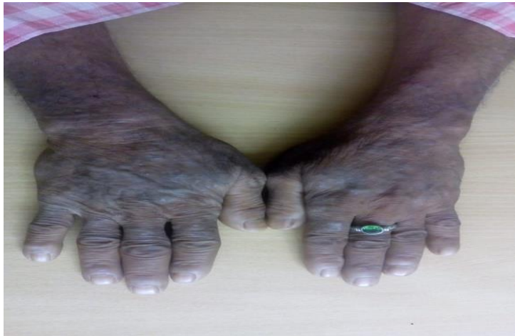
Fig 1- BEFORE TREATMENT