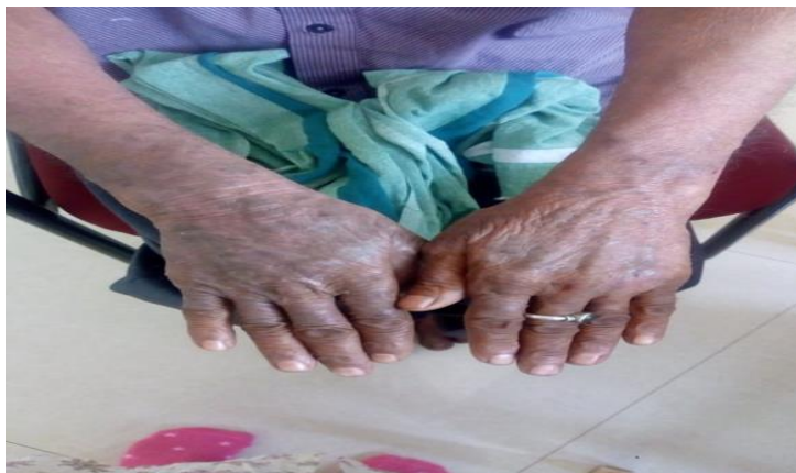
Fig 2- AFTER TREATMENT