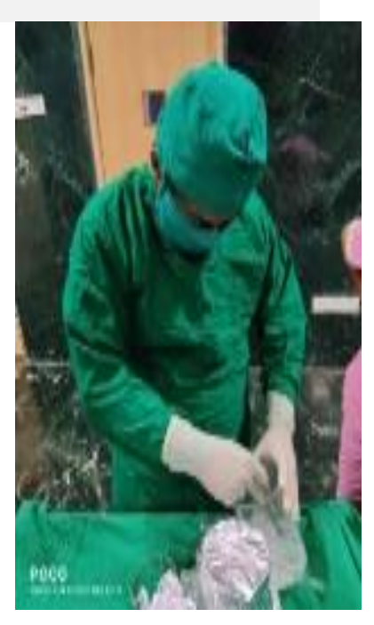
Fig 3. Mixing of Ingredients