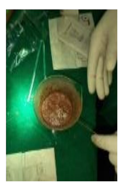
Fig 4. Final Mixture