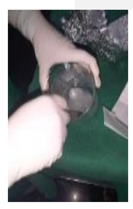
Fig 2. Preparation of Gel Base