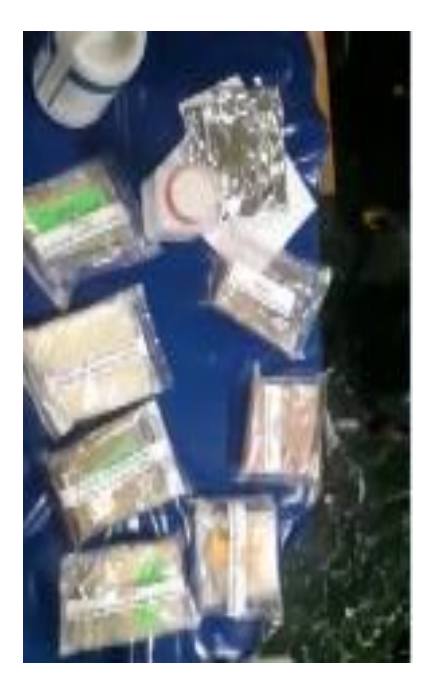
Fig 1. Drugs used in preparation