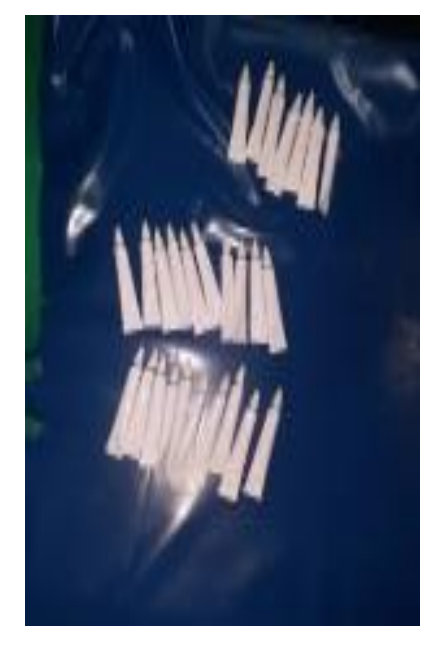
Fig 6. Final Product