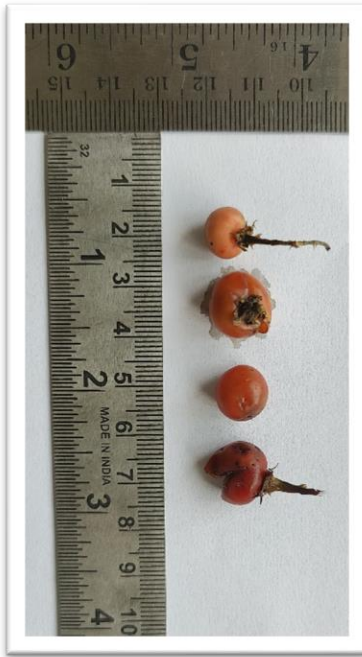
Fig-5 fruits of S. trilobatum