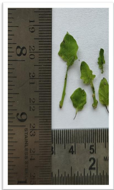
Fig-4 Leaves of S. trilobatum