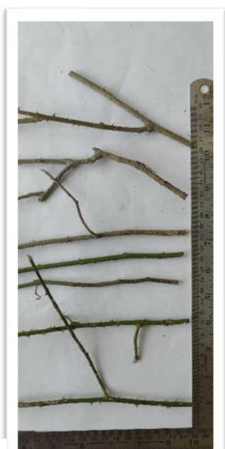
Fig -2 Stem of S. trilobatum