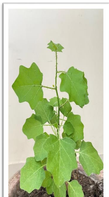
Fig-1 Whole plant of S. trilobatum