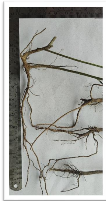
Fig-6 Roots of S. trilobatum