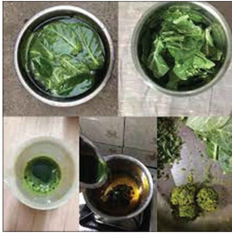
Figure 1: Preparation of arka taila