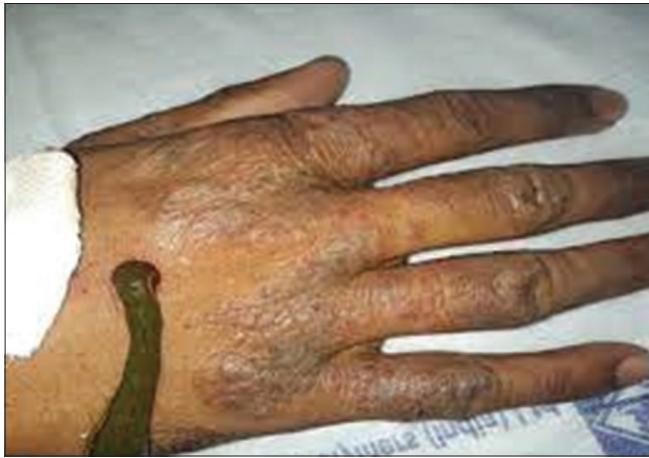
Figure 2: Jalaukavacharan