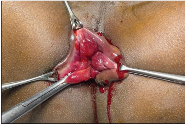
Figure 1: Prolapsed pile mass before treatment