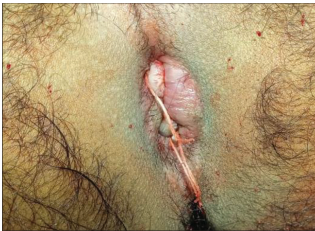
Figure 2: Piles mass after Kshar Sutra transfixation and ligation