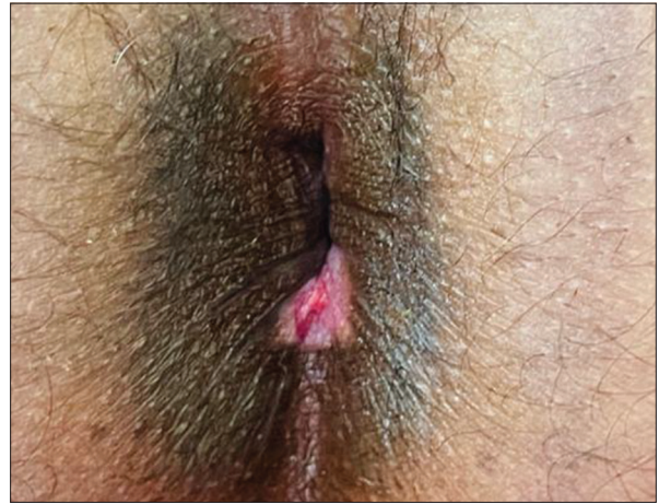
Figure 3: On 7 th post-operative day