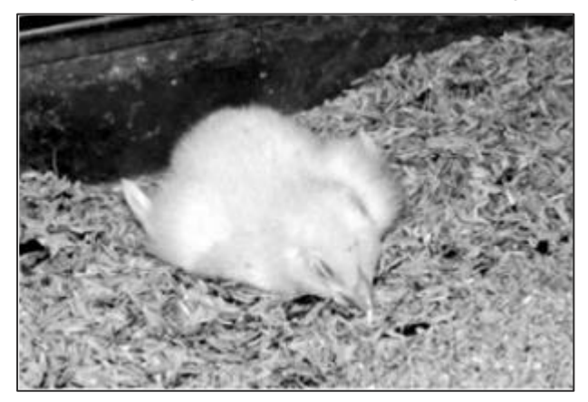
Fig. 1: Experimentally IBH infected broiler chick (A group) showing depressed appearance and inability to get up.

The clinical signs were observed within 2 days in infected/treated (T) day-old chicks of Group A, which included reduced feed intake, ruffled feathers, depressed appearance, and inability to get up and walk (Fig. 1). All the five birds in this group died on 3rd day giving 100 % mortality. Nakamura