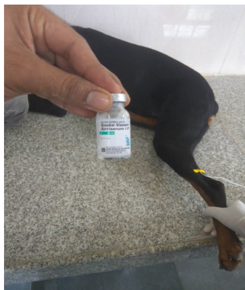
Fig. 3: Administration of Anti-snake venom

Snake venoms are complex mixtures of proteins and peptides, consisting of both enzymatic and non-enzymatic compounds. Snake venoms also contain inorganic cations such as sodium, calcium, potassium, magnesium, and small amounts of zinc, iron, cobalt, manganese, and nickel. The other components of snake venoms are glycoproteins, lipids, and biogenic amines, such as histamine, serotonin and neurotransmitters (catecholamines and acetylcholine) (Klaassen, 2008). Clinical signs such as frothy salivation, dullness, muscular weakness with abnormal gait observed in the present study could be attributed to the enzymatic and non-enzymatic compounds in the snake venom. Hyaluronidase cleaves internal glycoside bonds in certain acid mucopolysaccharides resulting decreased viscosity of connective tissues allowing other fractions of venom to penetrate the tissues. The cyanotic edema observed at the site of bite may be attributed to enzyme hyaluronidase, which acts as a spreading factor (Klaassen, 2008). The alterations in the hematological parameters might be due to damage to the blood cells by snake venom (O'Shea, 2005). Sometimes lyophilized polyvalent anti-snake venom may cause anaphylactic reactions (Sai Butacha Rao et al. , 2008) so to overcome the untoward effect of antivenom serum;