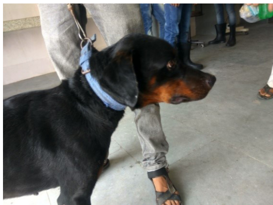
Fig. 2: Edematus swelling on the lower jaw