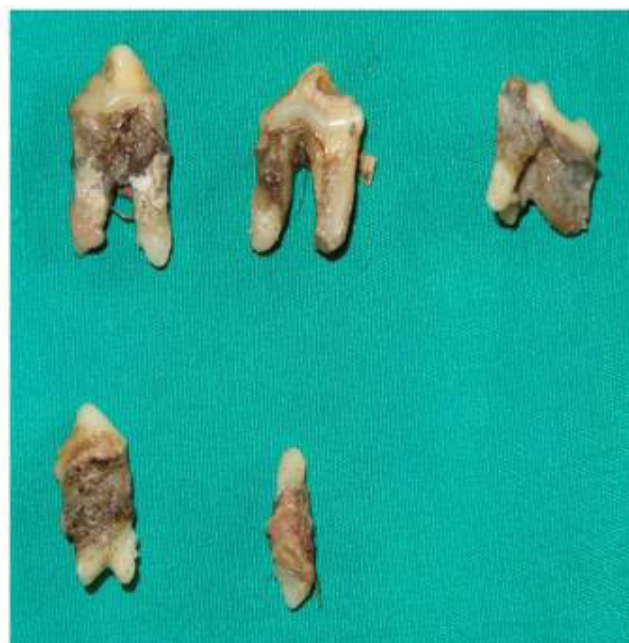
Figure 2: Dentistry showing the mobility of premolar teeth and their extraction in 2 out of 20 dogs

Kyllar and Witter (2005) reported the prevalence of dental disorders in 348 dogs (85%) out of 408 presented as clinical cases. Lyon (2000) opined that the prevalence of dental diseases in dogs increases up to more than 80% by 5 years of age.