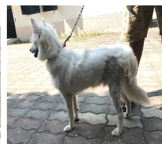
Plate 1: Hind quarter weakness in a dog before and after physiotherapy management