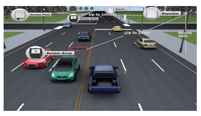
Figure 3: MEMS sensor solutions

The equivalents of these driver muscle functions are electromechanical actuators installed in the automated vehicle. They receive electronic commands from the onboard control computer and then apply the appropriate steering angle, throttle angle, and brake pressure by means of small electric motors. A sketch of automated communication is given in figure 3. Early versions of these actuators are already being introduced into production vehicles, where they receive their commands directly from the driver's inputs to the steering wheel and pedals. These decisions are being made for reasons largely unrelated to automation. Rather they are associated with reduced energy consumption, simplification of vehicle design, enhanced case of vehicle assembly, improved ability to adjust performance to match driver preferences, and cost savings compared to traditional direct mechanical control devices [16-24].