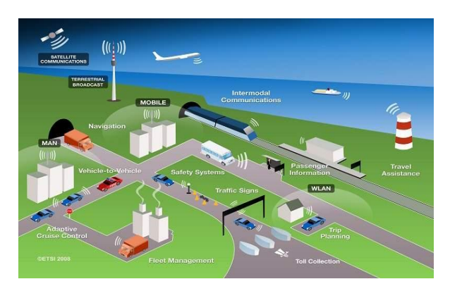
Figure 2: Smart Cities of The Future

Other researchers have used computer vision system to observe the road. These are vulnerable to weather problems and provide less accurate measurements, but they do not require special roadway installations, other than well-maintained lane markings. Both automated highway lanes and intelligent vehicles will require special sensors, controllers and communications devices to coordinate traffic flow. A national automated highway consortium is depicted in figure 2.