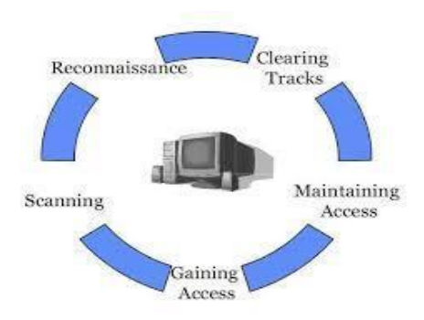
Fig. 3: Methodology of Ethical Hacking