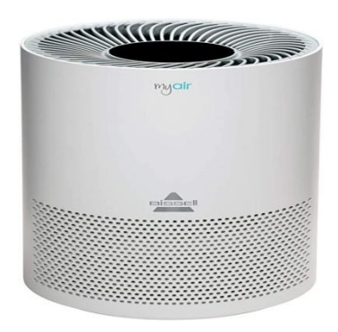
Fig 1: A general air purifier[3]