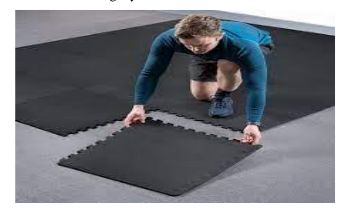
Figure 1: The above diagram shows the existing Gym mat for exercise [4]

The first "sticky" Gym mat produced commercially has been constructed of Polyvinyl chloride (PVC); its surface is smooth and inexpensive. More recently, several "environmentally friendly" mats allegedly manufactured of natural yute, organic cotton and rubber. The spongiest are the PVC mat, leading to greater "give" if walked on, and firmest are fibre-based mats like cotton or jute. The roughest of the jute mats are the "stuck" PVC mats, but also some of the contemporary textured mats are well suited for other materials. Smooth mats offer the most grips so that they may be used for the most intense forms, such hot Gym and Ashtanga vinyasa Gym; they might be less comfortable and dirtier faster [3]. Figure 1 shows the existing Gym mat for exercise.