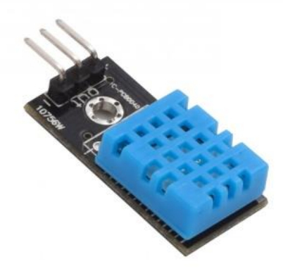
Figure 5: The above diagram shows the module of Temperature sensor [9]

3) Temperature Sensor: A temperature sensor is a device used to measure temperature. This can be air temperature, liquid temperature or the temperature of solid matter. The module of Temperature sensor is shown in Figure 5. In this device, it is used to measure the temperature of surroundings.