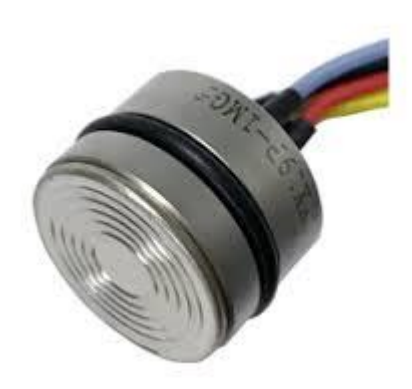
Figure 6: The above diagram shows the module of pressure sensor [10]