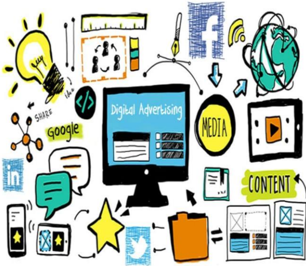
Figure 1: The above figure shows the evolution of Digital Advertisings [Adscholars].

internet. Figure 1 shows the evolution of digital advertisings[4].