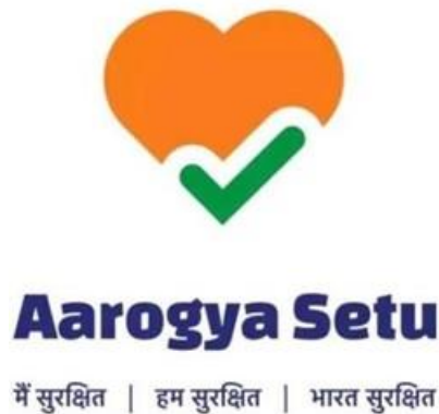
Figure 1: Symbol of Aarogya Setu App

it from the particular database systems such as google play store, Apple app store etc. and to install it in the smart phone. After installation it requires active GPS (Global Positioning System) and active Bluetooth, so that one could receive information about his/ her contacts who have been either infected or have the symptoms of Covid. The app also has a self- assessment feature, where an individual can provide the information about the symptoms of Covid, if he/ she feel such symptoms [7]. The app enables an individual to take appropriate action, if he/ she has met with the infected individuals or is in proximity of such contacts. More than 160 million individuals have downloaded the app [8], [9].