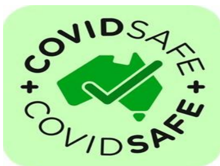
Figure 2: Symbol of COVID Safe app

The government of Australia has launched COVIDSafe app as a contact tracing app in April 2020. It is voluntary to install the app by the residents of Australia. It has been mandated by the government that the residents can delete the COVIDSafe app at any time, and it will delete the whole data about the app in the phone. The data about an individual who has enrolled once into the app, will be saved into the national COVIDSafe data store and will not be deleted automatically, if an individual deletes the app from the phone, unless the pandemic ends. However, the data about an individual can be deleted on his/ her request, by filling up the requisite application form provided by the government for the purpose [10]. In May 2020, the Parliament of Australia has amended the Privacy Act 1988 and passed the Privacy Amendment (Public Health Contact Information) Act to ensure the privacy of data related to the individuals who have enrolled into COVIDSafe and to support COVIDSafe itself. The COVIDSafe do not collect the information about the location of an individual. It has been provisioned by the government that the data collected will be used only by the health officials and police or other state or federal agencies will not have access to this data [11].