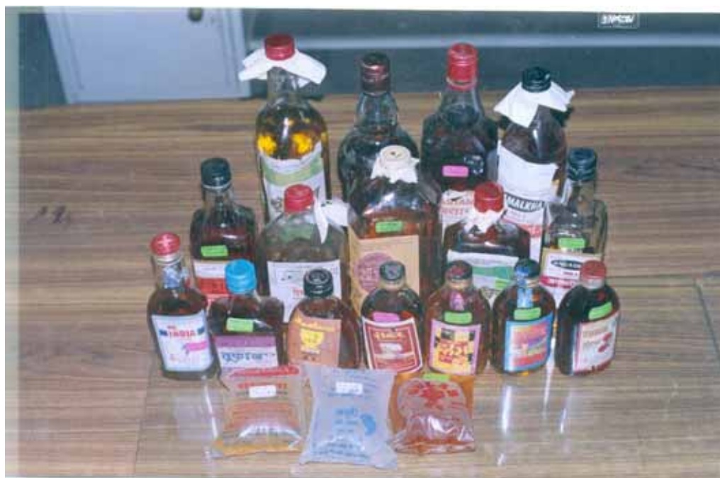
Fig.1 Country made liquors

Samples were collected at random from National capital territory of Delhi with the help of police and from the locally available country-made liquor shops (Fig.1).