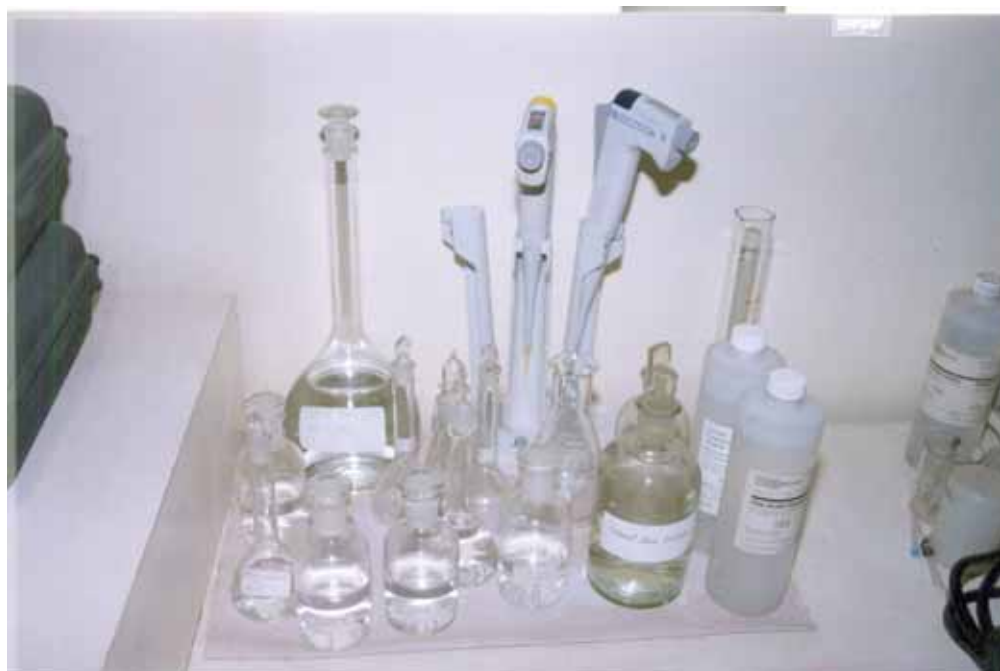
Fig. 3 Standard calibration of Ethanol