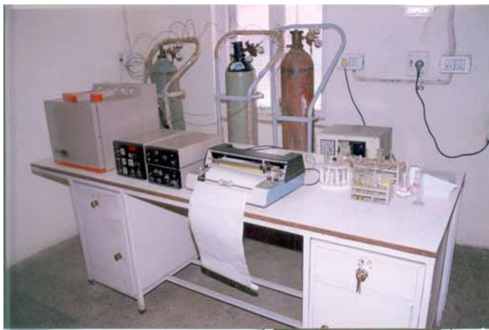
Fig.2 Gas liquid chromatography NUCON Series 5700

Samples were analyzed with the available 2 GLC instrument AIMIL- NUCON Series 5700 in the laboratory (Fig.2).