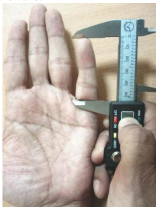
Figure 1 shows the length of the little finger of the left hand measured with the aid of a Vernier caliper from the tip of the digit to the ventral proximal crease.

The collected data was used to develop a linear regression equation that may be used to estimate height using percuteaneous little finger length, utilizing statistical calculations and the SPSS software.