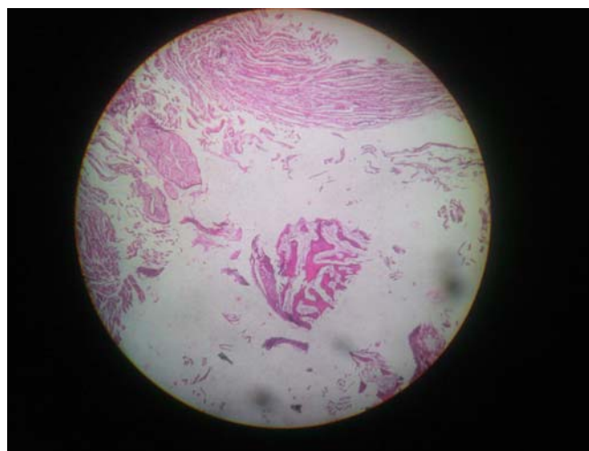
Figure 3: Bony trabeculae surrounded by myometrium are seen in the centre of the slide

medical literature where retained fetal bones was the cause of prolonged secondary infertility 2-7 . Symptoms due to this rare condition other than infertility include bleeding per vagina, dysmenorrhoea, dyspareunia and chronic pelvic pain 2-7 .