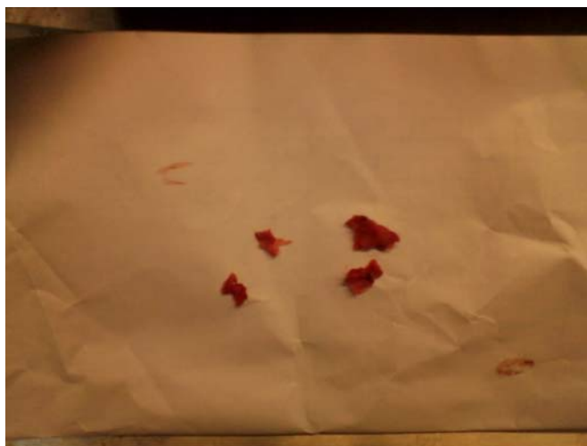
Figure 1: Four pieces of bony fragments recovered from the uterine cavity

Retained fetal bone in the uterine cavity post abortion is a rare cause of secondary infertility. Its incidence is unknown but they may cause significant and prolonged infertility. A study reports 0.15% incidence among 2000 diagnostic hysteroscopies 1 . Many cases are reported in