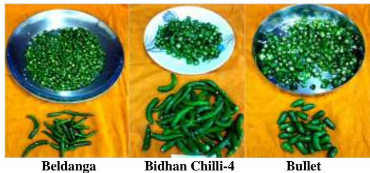
Plate 1: Chilli fruits of three cultivars before drying